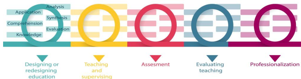
Figure 2. How Bloom's Taxonomy is integrated in the 5 UTQ competences.

Referring to the first UTQ competence, “Designing (or re-designing) a course”, it is highly important for lecturers to start with “knowing” and “comprehending” the contextual information and the pedagogical requirements of the course within a study programme. Once the lecturer has the proper confidence with the needed information (expected students’ level, workload of the course, assessment criteria), she/he can translate the gained knowledge in practice, “applying” it in designing a course.