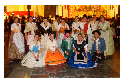
Guest Appearance: Grupo "El Garbí", Falla García Lorca-Olta